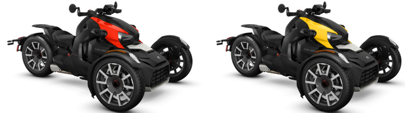
Units shown with Classic Series panel kits.