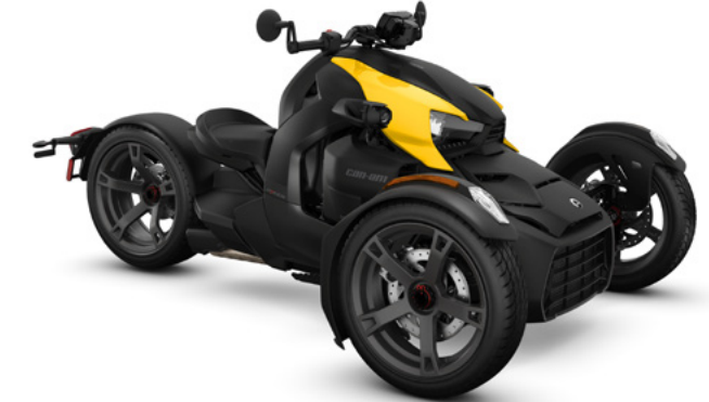
Units shown with Classic Series panel kits.